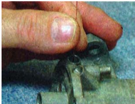
One way to free a plugged pilot jet is to clean it out with a section of copper wire as shown.

properly, and poor performance through about one-eighth throttle, where the needle jet takes over.